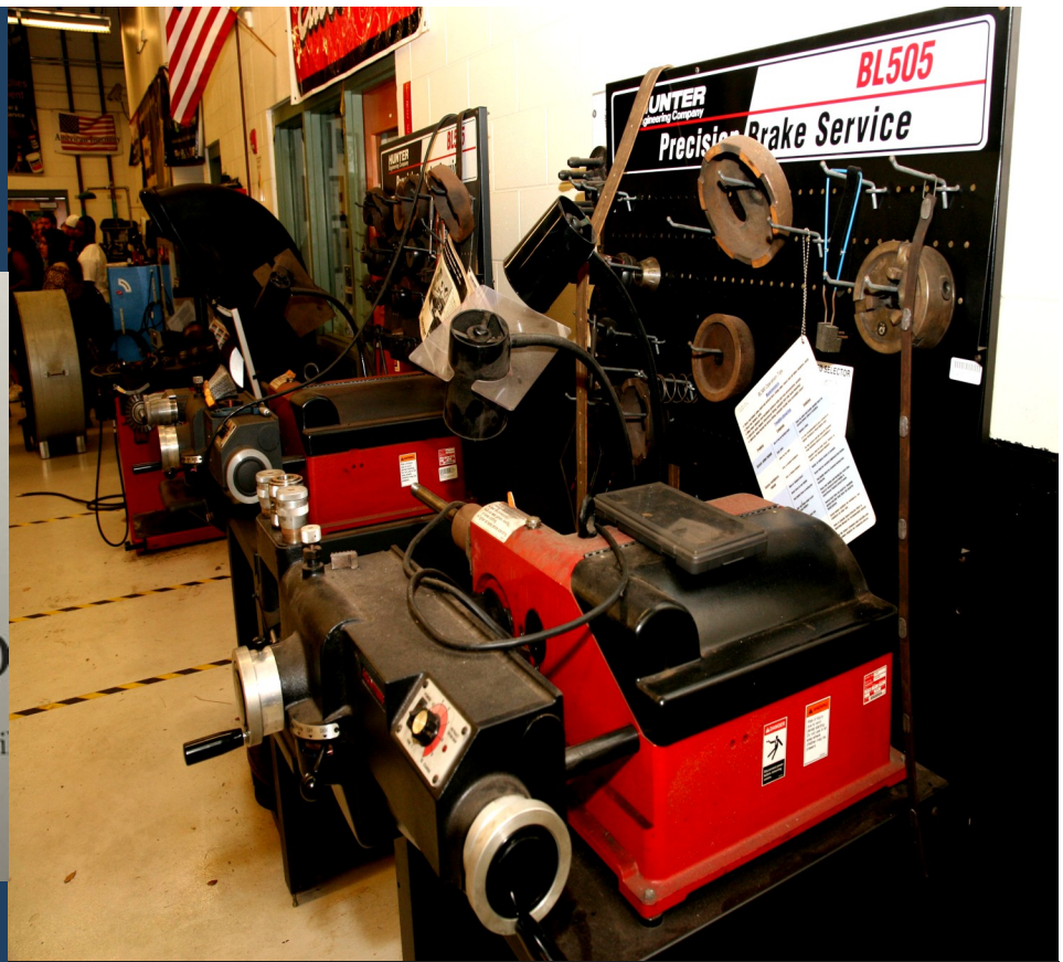
Automotive shop at Suncoast Technical Education Center