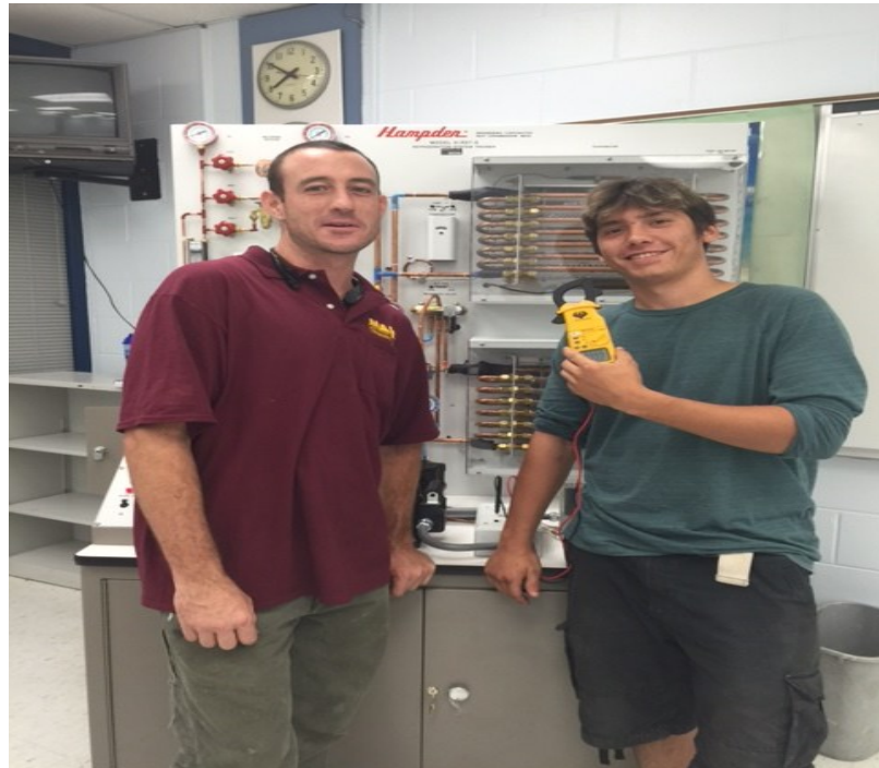
HVAC Classroom at Suncoast Technical Education Center