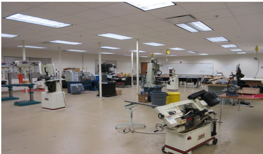
Manufacturing area at Suncoast Technical Education Center